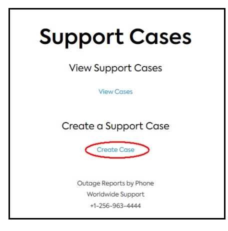
Figure 3: Select Create Case

2. Open a support case to report the activation. Navigate to http://www.adtran.com/support and select Open a Ticket Online . Once you are logged in, select Create Case :