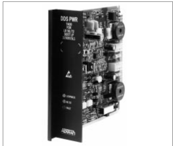
Figure 1. ADTRAN T400 DDS PWR

V - Constant -130 V output: used when powering a DDST LP.